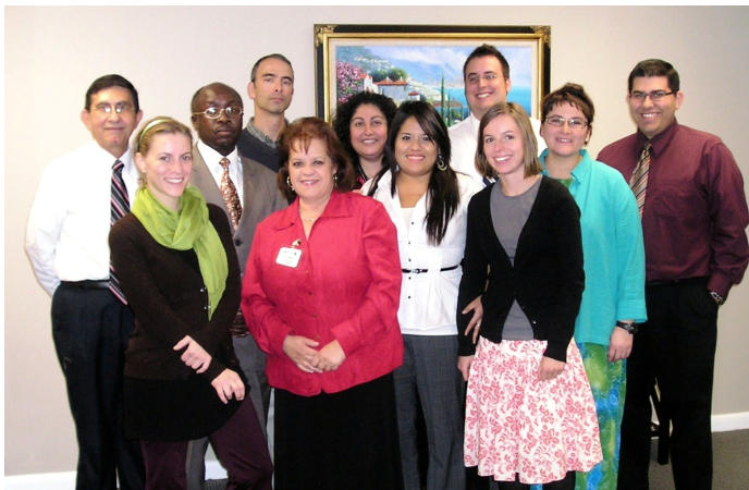
Health Access Project's staff and case management team is culturally diverse, hailing from Venezuela, Argentina, Mexico, Columbia, Chile, Zambia, and three different states; Washington, Alabama, and Utah. Between them, they speak five different languages: English, Kinyarwanda, Kirundi, French, and Spanish.

Health Access Project is a department of Community Health Centers, Inc.